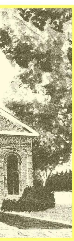
April 28, 2024 Fifth Sunday of Easter